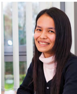
Skulrat from Thailand

“I was very happy to participate in the Quality Engineering course. All the professors, staff and students were very friendly and helpful, and the study support system OSCA was very useful. I learned many new things in the technical modules, and it was a pleasure to master tasks with practical applications. I took part in many activities for students where you can meet new friends. The course was a good opportunity to study not only engineering moduls, but also English and German.“